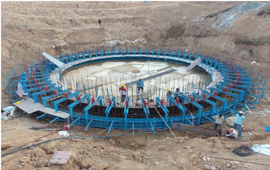
SLIP FORM ERECTION AT BOTTOM