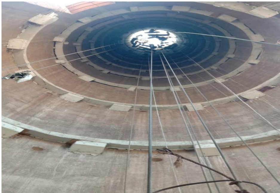
INNER VIEW OF CHIMNEY