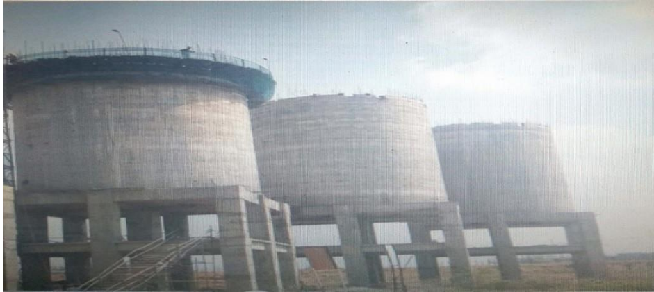
Moser bare Thermal power project-Jaithari

20)Name of the Project: )Moser Baer Thermal power project, Location: Jaithari, Distt. Anuppur(M.P.) Year -2014. Work Type: Fly ash Silo 12 m ID- 05 nos